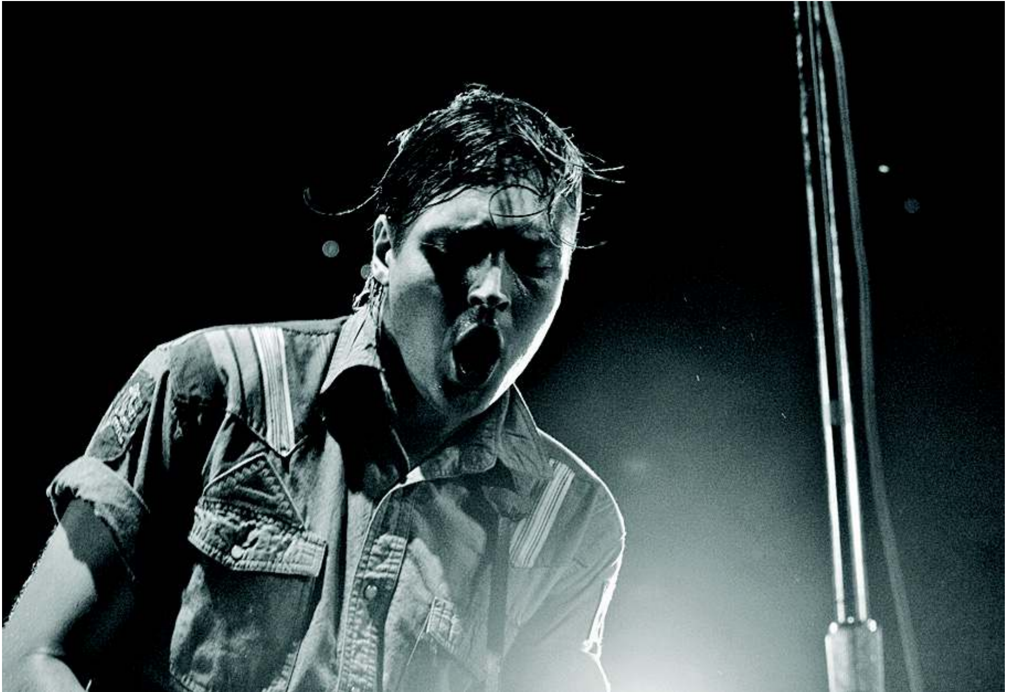
Arcade Fire's Win Butler performs at the Toronto Island concert.

Arcade Fire's Toronto Island performance encompasses their career.