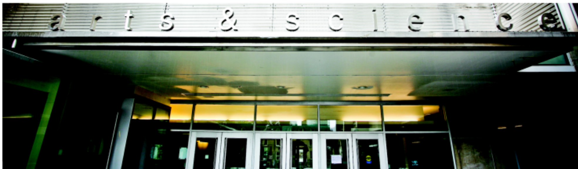
Public meetings planned to occur in fall to discuss changes that still require governance approval.

Dean says streamlining will cut costs, enhance undergrad experience. Professors and students are crying foul.