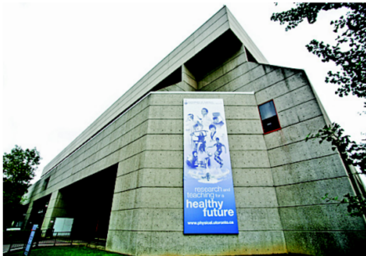
U of T's Athletic Centre at 214 College Street.

U of T charges us for student services, health services, athletics, Hart House, and Constituent College fees. It also charges us on