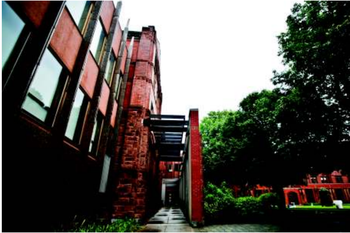
The Munk Centre aims to bridge government, business and NGO work with its new Masters program.